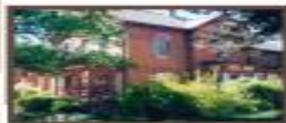
Rain House Saratoga Springs